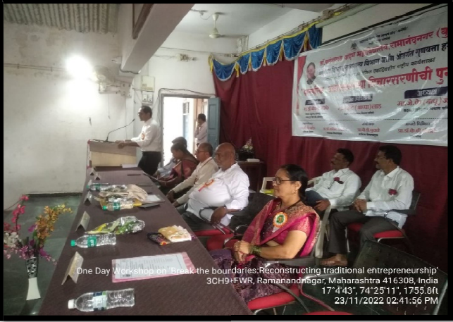
Dignitaries present for one day National workshop on 'Reconstruction of Traditional Entrepreneurship Ideology